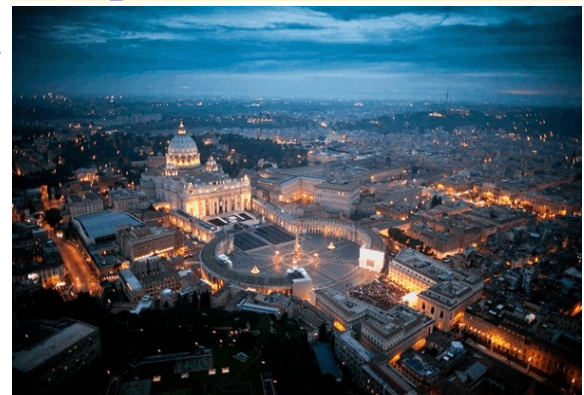
Vatican City in Rome which is governed by the Holy See [seat]. The Roman Catholic Church/State has established diplomatic relationships with 179 nations around the world.